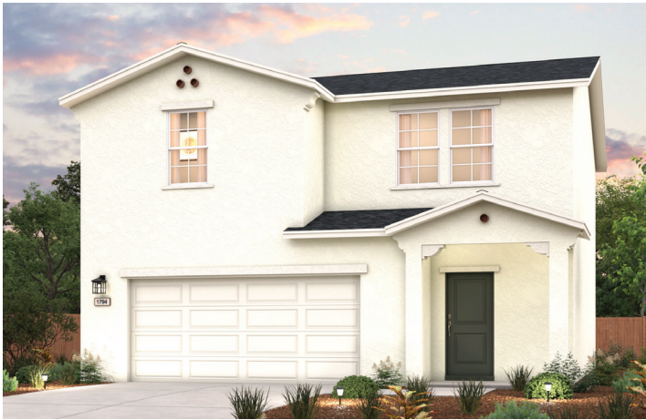
ELEVATION A - EARLY CALIFORNIA

APPROX. 1,794 SQ. FT. | 2-STORY | 3 BEDROOMS | 2.5 BATHROOMS | 2-BAY GARAGE