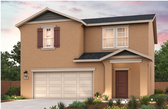
ELEVATION C - COTTAGE