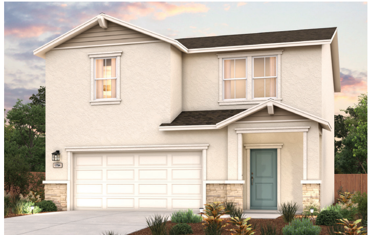
ELEVATION D - CALIFORNIA RANCH