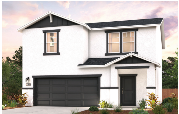
ELEVATION B - BUNGALOW