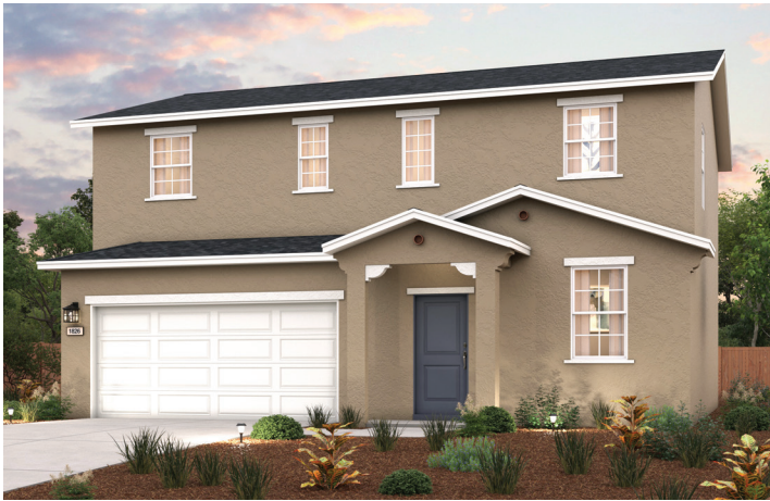
ELEVATION A - EARLY CALIFORNIA

APPROX. 1,826 SQ. FT. | 2-STORY | 4 BEDROOMS | 3 BATHROOMS | 2-BAY GARAGE