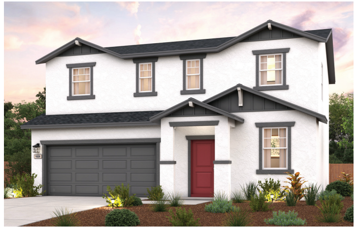
ELEVATION B - BUNGALOW