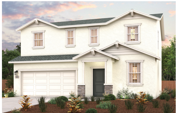
ELEVATION D - CALIFORNIA RANCH