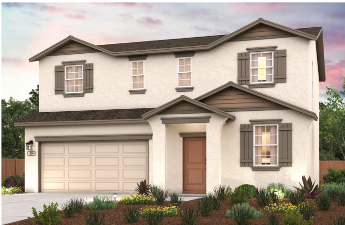
ELEVATION C - COTTAGE